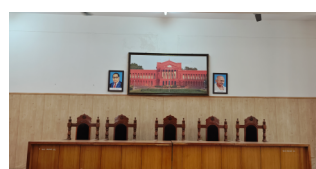
Moot Court Hall