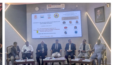
Two-Day International Conference on 75 years of Governance Under the Indian Constitution :