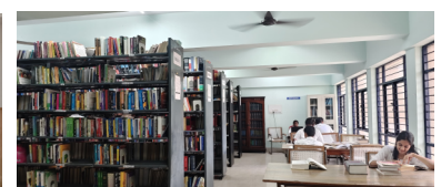
Library - Reference Section