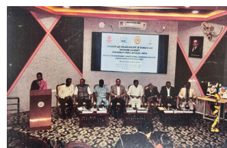
One day Inter - Disciplinary Constitutional Awareness Workshop