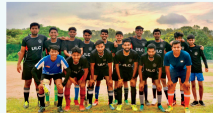
ULC Football Team, 2019