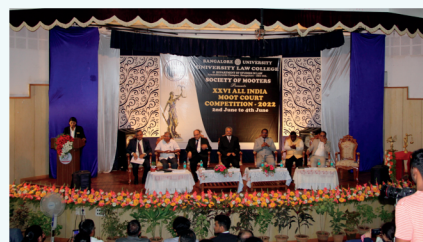
26th ULC National Moot Court Competition, 2022