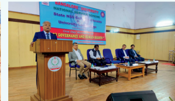
Workshop on Human Rights by Hon'ble Justice B. S. Patil, Hon'ble Lokayuktha, State of Karnataka