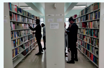
Library - Reference Section