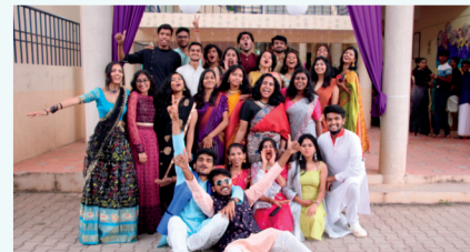
Abhivyaktha - ULC Ethnic Day Celebrations, 2022