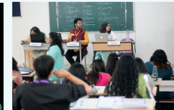
Proceedings of UNHRC Committee, ULC-MUN, 2022