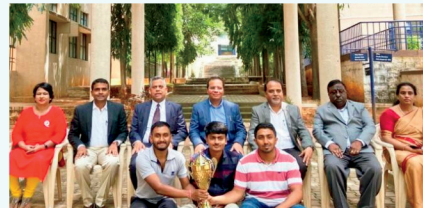
Winners of St. Joseph National Moot Court Competition, 2022 with Vice Chancellor, BUB, Principal & Faculty members, ULC