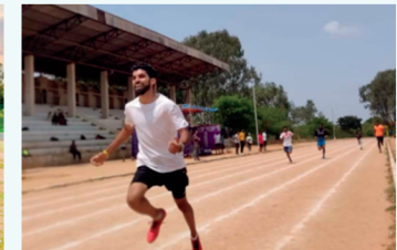
ULC Bagging Gold in Sprint 100M Spiritus - 2018