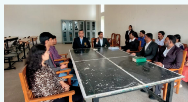
Legal Aid Room