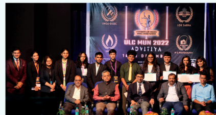
3rd ULC National Model United Nations Conference, 2022