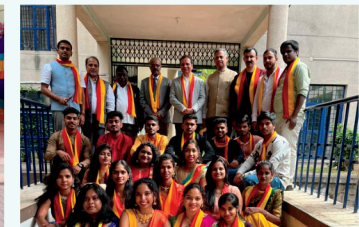
Kannada Kalarava - Kannada Rajyotsava Celebrations, 2022