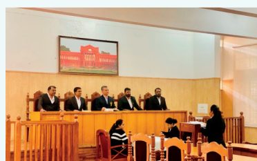
Moot Court Hall